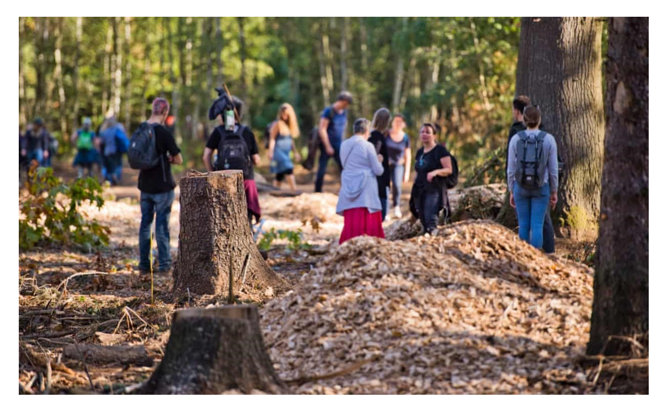
Protesters next to trees felled in the Hambach forest before a demonstration calling for the forest to be saved and the government to outlaw lignite as an energy source.