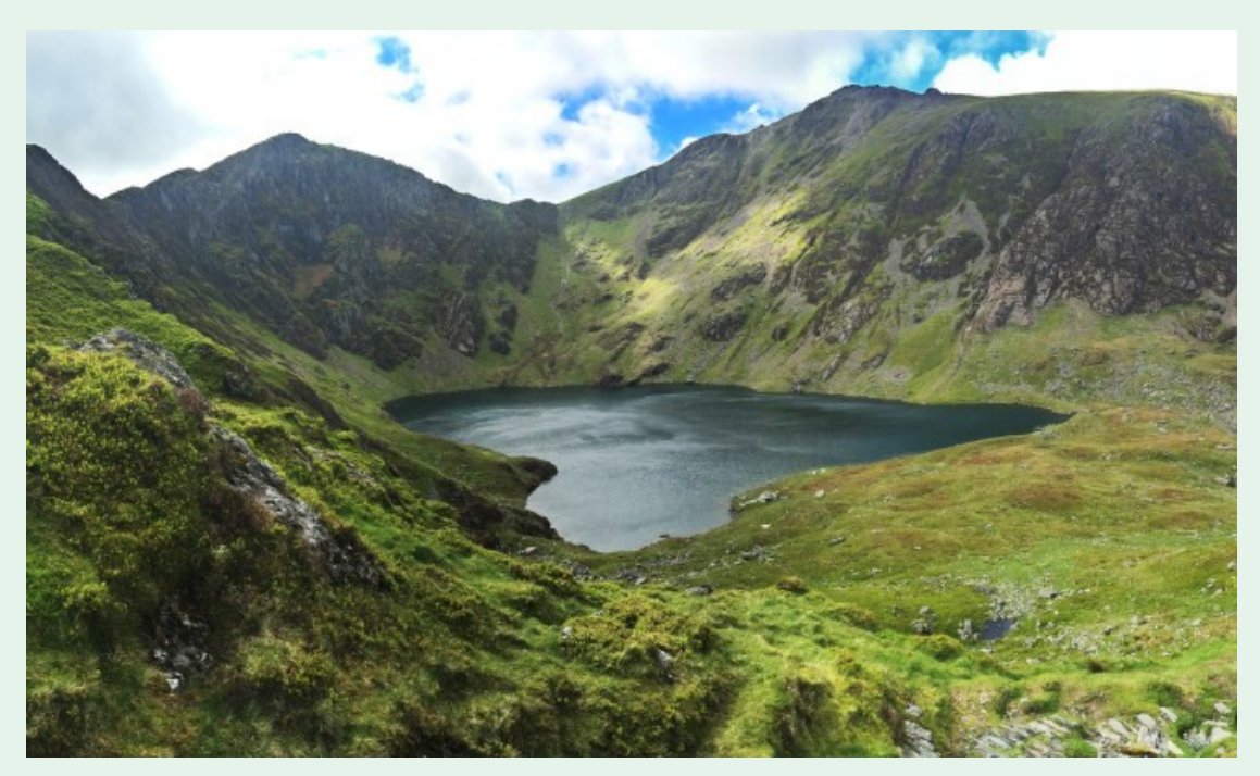
The Welsh say anyone who sleeps on top of the mountain comes down a poet or a madman.

You will be asked to subscribe to the Network of Ley Hunters. £15 per annum per household (sharing a magazine) brings four quarterly newsletters plus access to Moots and other activities.