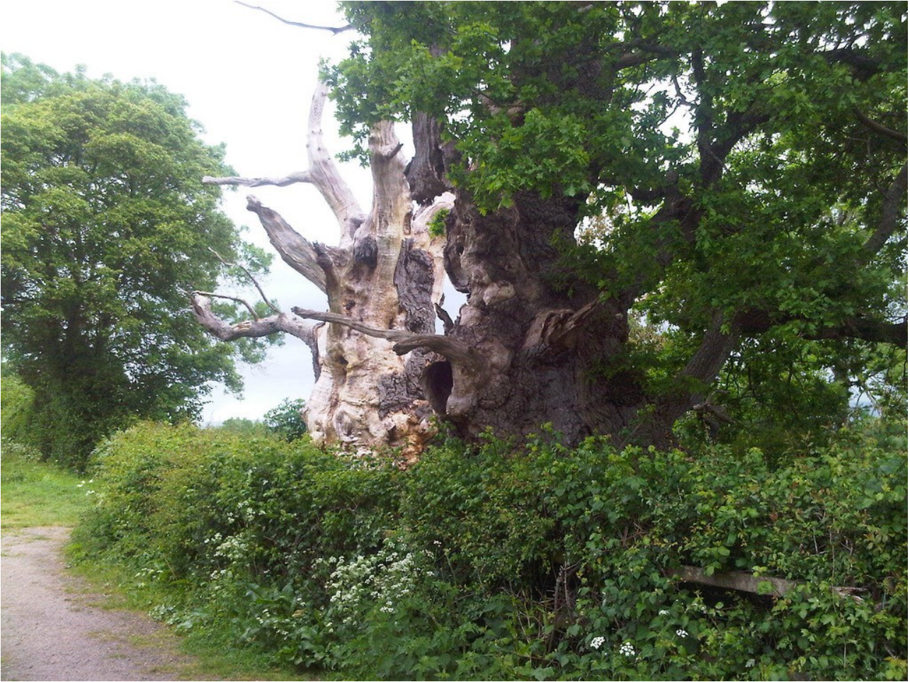
Gog & Magog, near Glastonbury, Somerset

Our next planned pilgrimage will start soon, and take until September 2019 to complete. It will be walked in stages of about 50 miles each. This will take us along the Meridian running north of Glastonbury (Somerset) from Stonedown/Gog and Magog area (to be dowsed), approximately 2 degrees 41' west. This pilgrimage will finish at Glassonby/Lazonby in Cumbria, near Long Meg and her Daughters. The route will go via Tintern, Kymin Naval Temple above Monmouth, Blackwardine Crossroads (where Alfred Watkins had his initial vision of Leys), Dinedor Serpent, Queen Eleanor's Bower east of Shrewsbury, Whitchurch, and so on up to Shap in Cumbria.