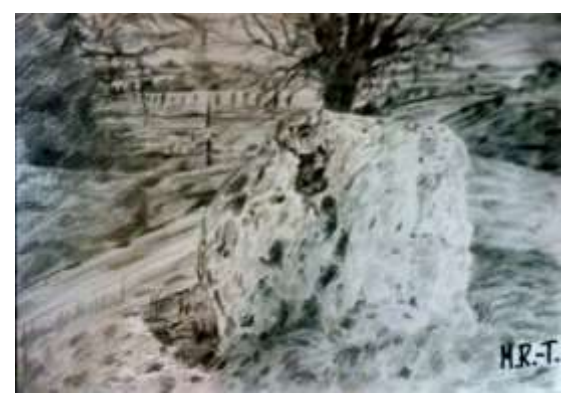
Winterbourne Bassett by Marc Rhodes-Taylor

Langdean Bottom is described as a circle and a north and south line, with a stone circle to the east with two stones forming an entrance. Langdean may have been a circle or a round barrow or a dwelling. Nikolaus Pevsner wrote of a circle of undressed sarsen; Piggott wrote of a round barrow thirty feet across. Terence Meaden thought these stones might be a foundation ring for supporting the floor of a hut. Neil Mortimer also mentions this. Pevsner states that east of Langdean lies a short avenue; Leslie Grinell noted two parallel rows of upright sarsens running west to east with three rows. The circle might have been the site for a house, typical of Dartmoor and Exmoor, a people who abandoned upland areas during the Middle Bronze Age. The enclosure is a rectangle and may have formed two or three houses. The rings and rows themselves are unusually close.