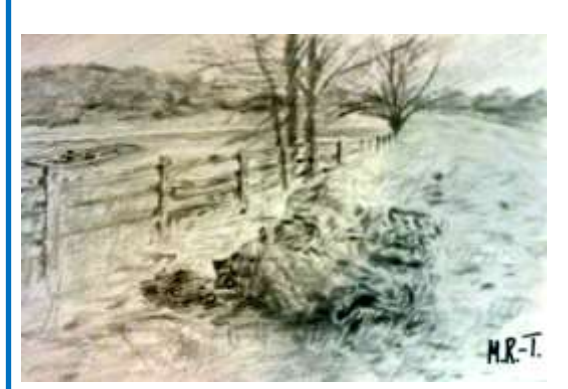
Coat water

Coate Water is a beautiful country park just at the outer edges of Swindon, between Swindon and Hodson Chiseldon. The views from this location are quite stunning, the park itself green and peaceful in the shade with much to offer for walkers and those looking for a day out. Richard Jefferies, the famous writer and naturalist, once lived here. The Richard Jefferies museum is worthy of further study in itself, and Swindon Central Library has a very rare and valuable collection of Richard Jefferies's texts within its heritage section.