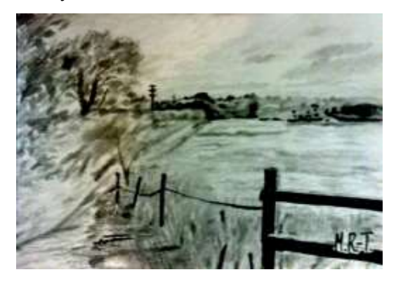
Fir Clump by Marc Rhodes-Taylor

The Megalithic Portal describes Coate as five flat fallen stones, with Nanny Howe having three barrows. Coate itself has been dated between the late Neolithic and Early Bronze Age, 3300 to 900 BCE, and connected to the northern sky and the north star. Coate once contained a circle, two round barrows and a Bronze Age settlement. Half a circle of six stones and three stones appear to line up with three stars. The influence of immigration from the south west is suggested by rows of stones being added to existing rings. These monuments may represent supernatural entities. In Neolithic Britain stone was associated with the dead and wood with the living. Stone might also represent the deities. The most widely accepted theory is that the circle used to be connected to the worship of the Sun and the Moon, or to water worship